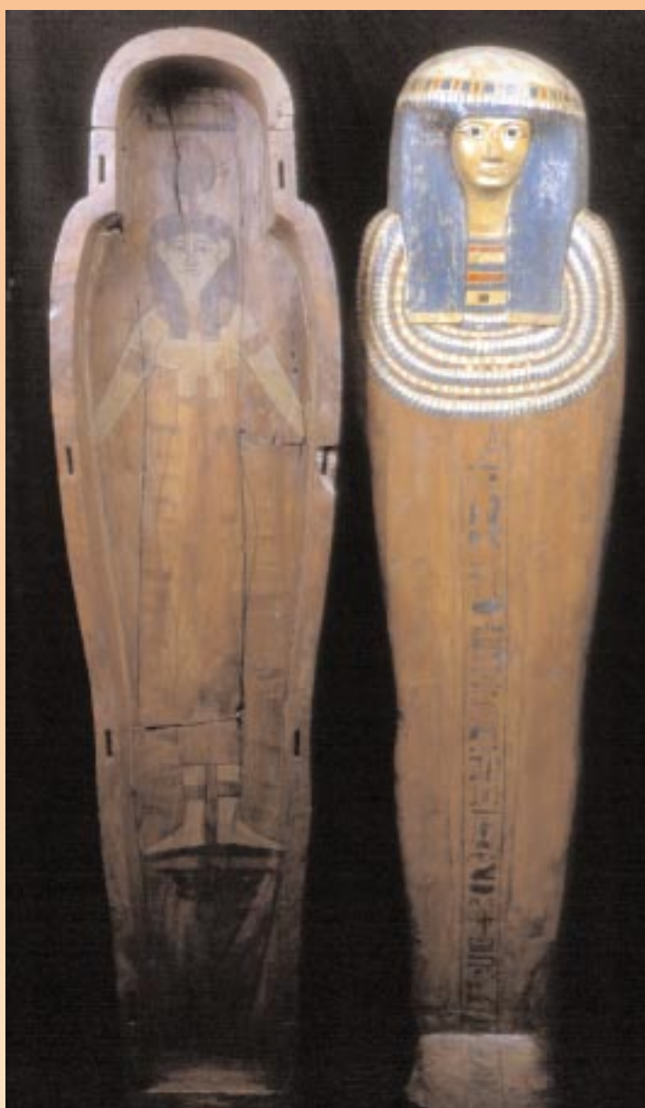
The coffin after restoration; the image of the goddess Nut can be seen on the inner lining of the coffin.