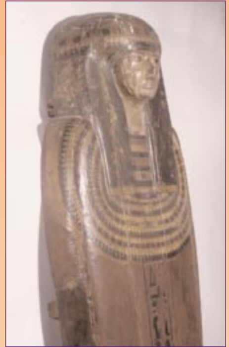
Above: the outer coffin before restoration—note its colors darkened by age and dirt, as well as its damaged surface. At left, the outer coffin is cleaned and filled prior to inpainting.